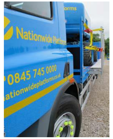
Walkway with fall protection