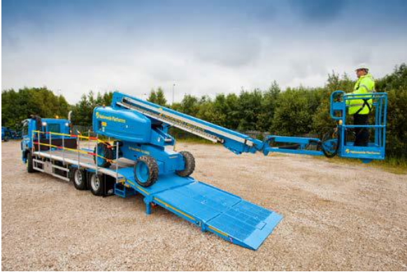
Low loading angle