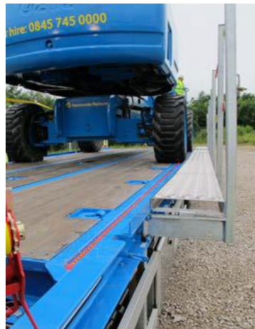
LED safety lighting