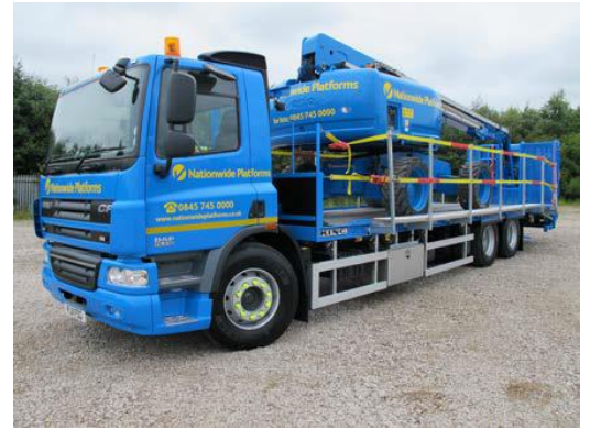
Hi-vis handrail and driver fall protection