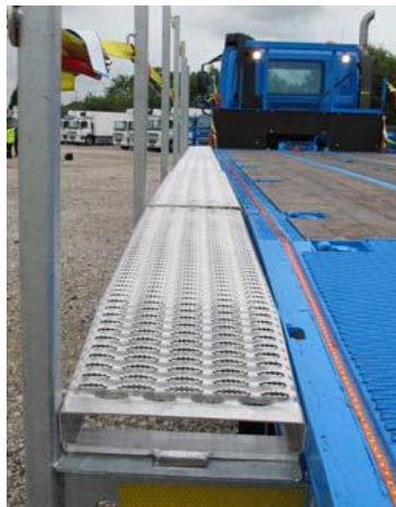
Driver safety walkway